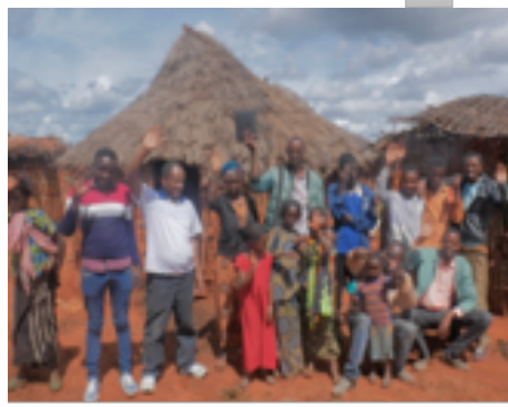
Generations of Church Multiplication - Godana